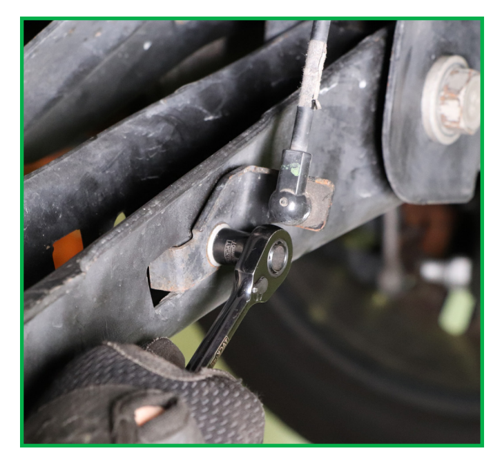
FIGURE 19 FIGURE 20