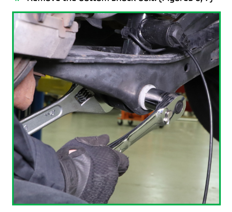
4. Remove the bottom shock bolt. (Figures 6, 7)