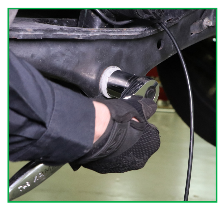
FIGURE 17 FIGURE 18

5. Reconnect the ride height sensor bracket to the lower control arm. Tighten to manufacturer's specifications. (Figures 19, 20)