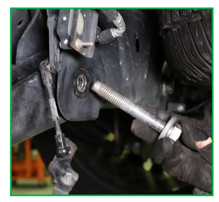
FIGURE 8 FIGURE 9