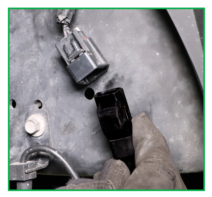
FIGURE 21 FIGURE 22

7. Finish tightening top mount nuts to manufacturer's specifications. (Figure 23)